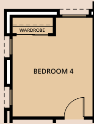
OPTIONAL BEDROOM 4 IN LIEU OF DEN