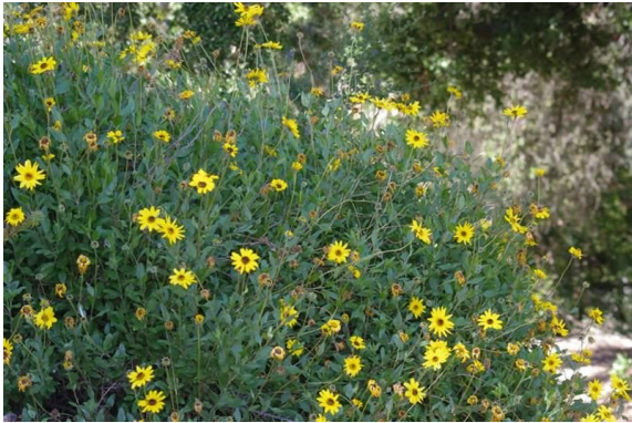
Encelia californica "Coast Sunflower"