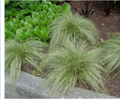
Carex Albula "Frosted Curls" Sedge