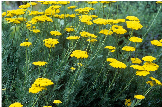
Achillea Moonshine "Moonshine Yarrow"