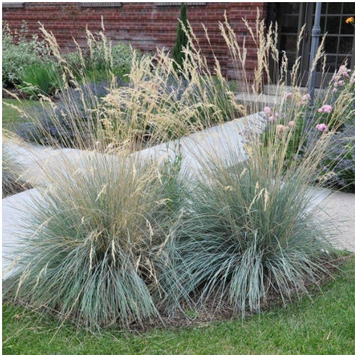
Helictotrichon sempervirens "Blue Oat Grass"