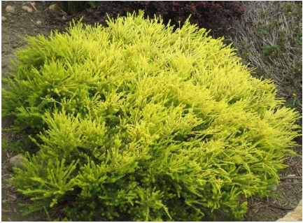
Coleonema "Sunset Gold"