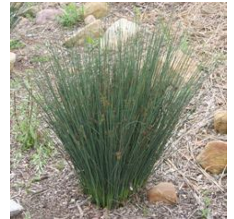
Juncus patens "Elk Blue" (shade)