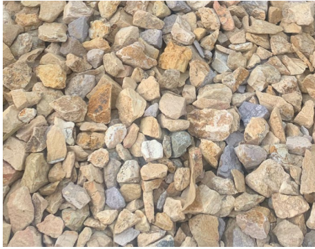
Mojave Gold 3/4"