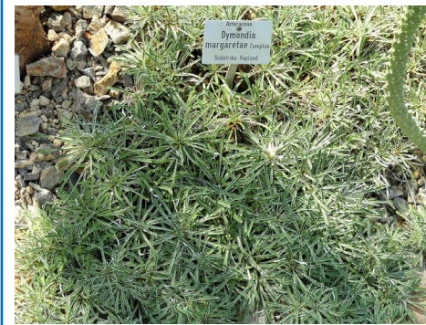
Dymondia Margaretae "Silver Carpet"