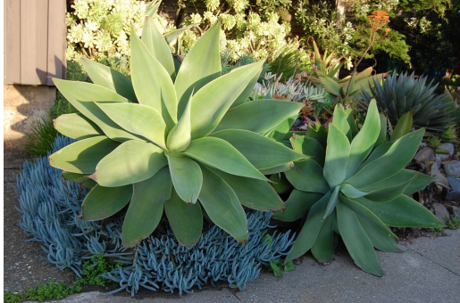
Agave attenuata "Foxtail Agave" (full sun)