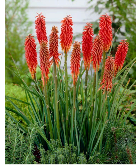
Kniphofia "Nancy's Red Hot Pokers"