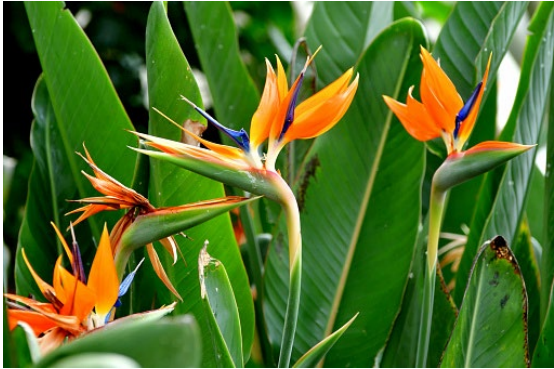
Bird of Paradise