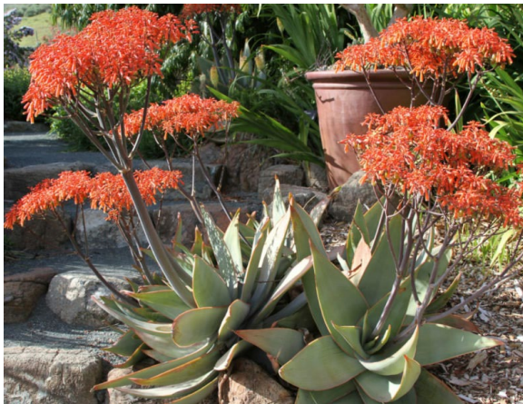
Aloe striata "Coral Aloe" (full sun)