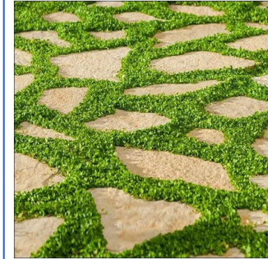
Dichondra (part sun/shade)