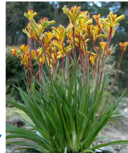
Anigozanthos flavidus "Kangaroo Paw" (red & yellow)