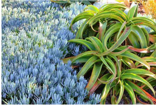
Senecio "Blue Chalksticks"

Exposed dirt is another acceptable option.