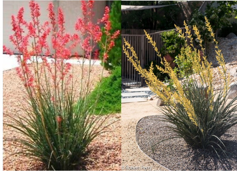
Hesperaloe parviflora "Red Yucca" & "Yellow Yucca"